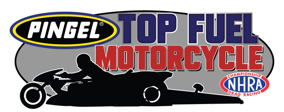
DESIGNATION TFM, followed by motorcycle number.